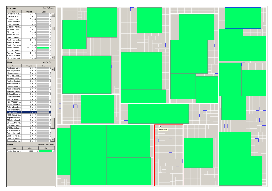
Figure 4: The context can be used to formulate queries. Therefore, all items of the context treemap can be selected and deselected by mouse clicks, and the resulting query is visualized by red borders. Similarly, selecting a fund or set of funds in the overview, filter, or depot view (Prudential is selected in the Filter here) emphasizes the stocks owned by the fund(s) via blue borders.