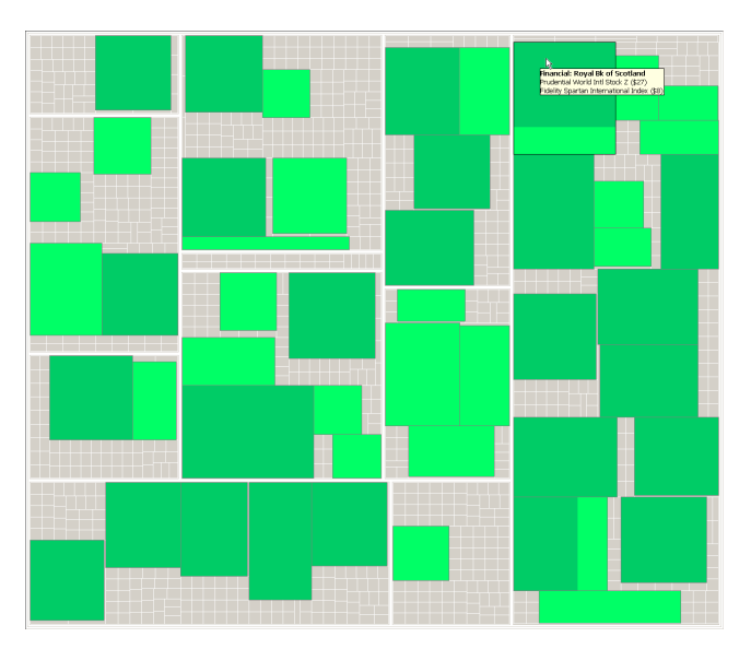
Figure 5: Stocks held by multiple funds are visualized by rectangles with different colors. The distribution of funds within stocks is simply another level of the visualized tree.

Figure 5 shows the user's portfolio after investing in an additional fund. In this example, the stock in the upper right corner (indicated by the mouse pointer) is common to both funds, so it is rendered in two different colors with the areas of the two regions corresponding to the holding by each fund. Note that any number of funds can be added to a portfolio as desired by the user.