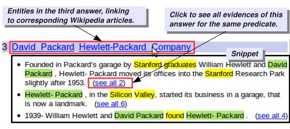
Figure 3: Result Presentation

y) by clicking the "Add" button beside its predicate and a blank input field appears below it. The user can also remove additional predicates by clicking the "X" mark beside them.