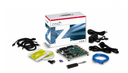
AMD Zynq-7000 All Programmable SoC ZC702 Evaluation Kit