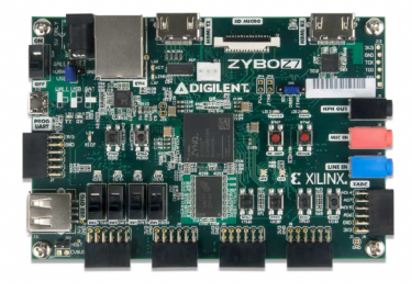
Digilent Zybo Z7 Development Kit